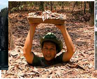
Co Chi Vi etcong Tunnels