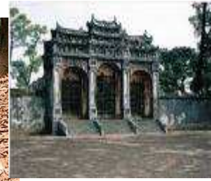
Emperor Minh Mang Mausoleum