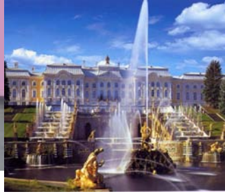
Peterhof - St Petersburg