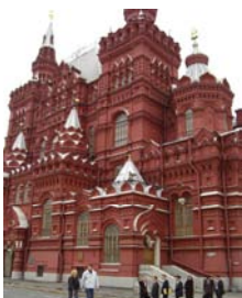
Kremlin Red Square