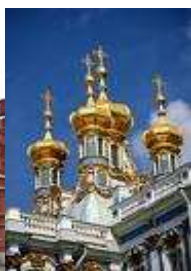
Catherine Palace - Ball Room