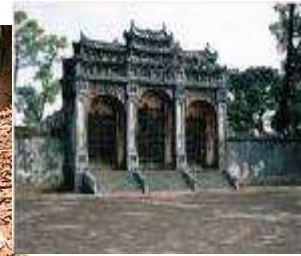
Emperor Minh Mang Mausoleum